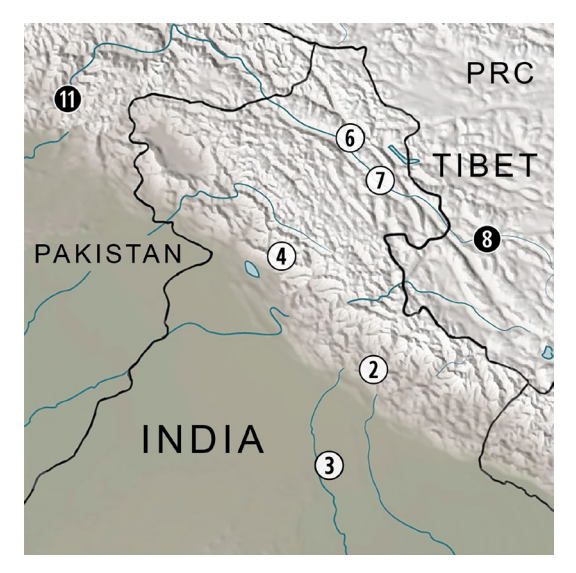
Map 2: Relevant places in the western Himalayan region.