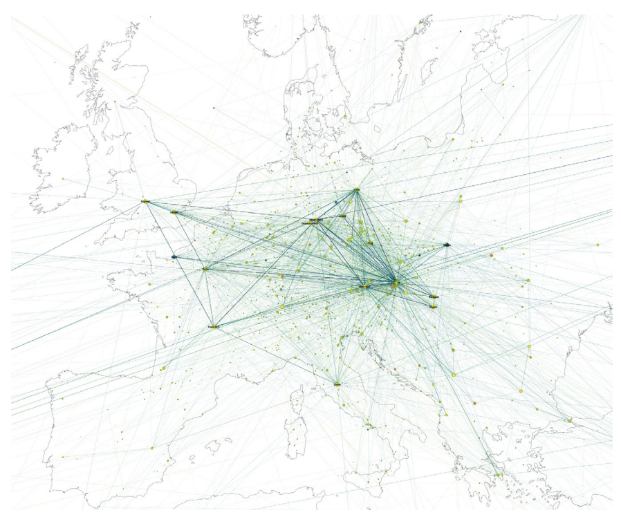
Fig. 2: Experiment on European scale projecting place names types and cooccurrences through time.

vitriolic recording of political life, toponyms in Die Fackel tell a story about the ongoing reconfiguration of Europe.