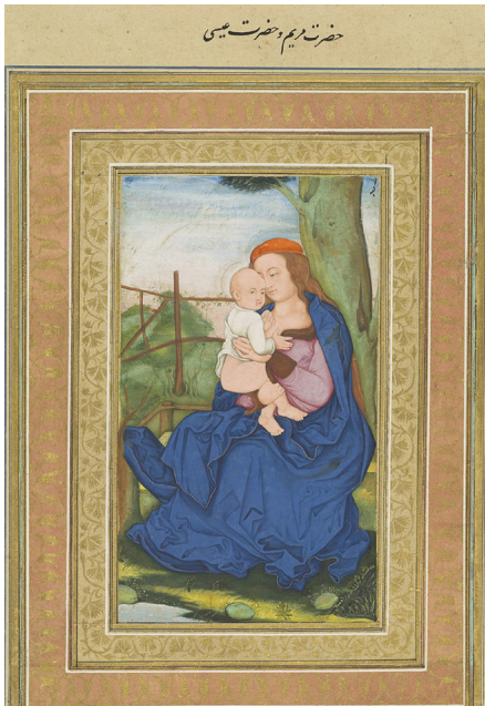
Fig. 7. The Madonna and Child, after Dürer, early seventeenth century, ink, opaque watercolor, and gold on paper, folio 26 of a late eighteenth century Mughal album, 20 x 12.2 cm (image), Windsor Castle, Royal Collection Trust, RCIN 1005069.aa. (Detail of the page).