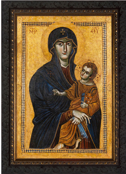
Fig. 1. Icon of the Virgin Mary with the Infant Christ (“ Salus Populi Romani ”), paint on cedar wood, probably late antique with overpainting of thirteenth century, Borghese Chapel, Santa Maria Maggiore, Rome.