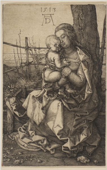
Fig. 5. Albrecht Dürer; Madonna by the Tree, 1513, engraving on paper, 11.6 x 7.5 cm, Windsor Castle, Royal Collection Trust, RCIN 800045.

Hasan, who would later be praised by Jahangir as one of the greatest artists of his time. 59 Various authors have emphasized the emulative character of this drawing, which, according to the inscription, was created by Abu'l Hasan at the tender age of thirteen. 60 In this drawing, in a kind of intercultural paragone , the young Mughal painter places himself in direct competition with Dürer, who, like others among his European contemporaries, had prided himself on his precocious artistic talent. 61 Dürer's prints thus offered the court painters an opportunity both to engage with some remarkably evocative examples of European art and to compete with an esteemed master of a different artistic language and tradition.