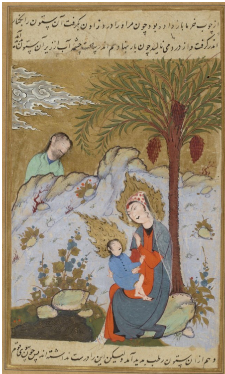
Fig. 8 Aqa Riza-i-Abbasi (attr.), The Nativity , ca. 1595, opaque watercolor on paper; from: Naysābūrī, Qīṣaṣ al-anbiyāʾ , Quazwin, Bibliothèque Nationale de France, Département des Manuscrits, supplément persan 1313, f. 174.

painting, is maybe even less important than the changed orientation of the Madonnas in the Mughal albums. The altered lines of sight and the modified mood of the scenery may even change the (devotional) relationship that the viewer establishes with the figures depicted. The Muslim renderings of Virgin and Child are not about compassion, but rather about holiness and veneration. This is accentuated by the style of the painting, which Verma, Amaladass, and Löwner have described as “idealized.” 78 The adoption of such a stylistic idiom cannot simply be considered a matter of taste and tradition, for it also encompasses the Mughal artist’s reduction of Dürer’s chiaroscuro contrast, of the depths in the folds of the garment, and of the complexity of the lines. There is reason enough to believe that these choices, which significantly attenuate the drama of the painting, were made after careful consideration. The resulting pictorial representations have a quieter and softer surface, which, on a semantic level, emphasizes the integrity and sanctity of the figures. Stylistic decisions therefore play a cardinal role here in transforming the religious meaning of the European model that the Mughal artist worked from.