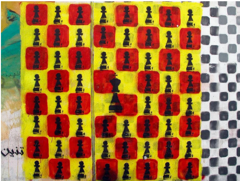
Fig. 15: el-Teneen, The king is back , 2014. Cairo.