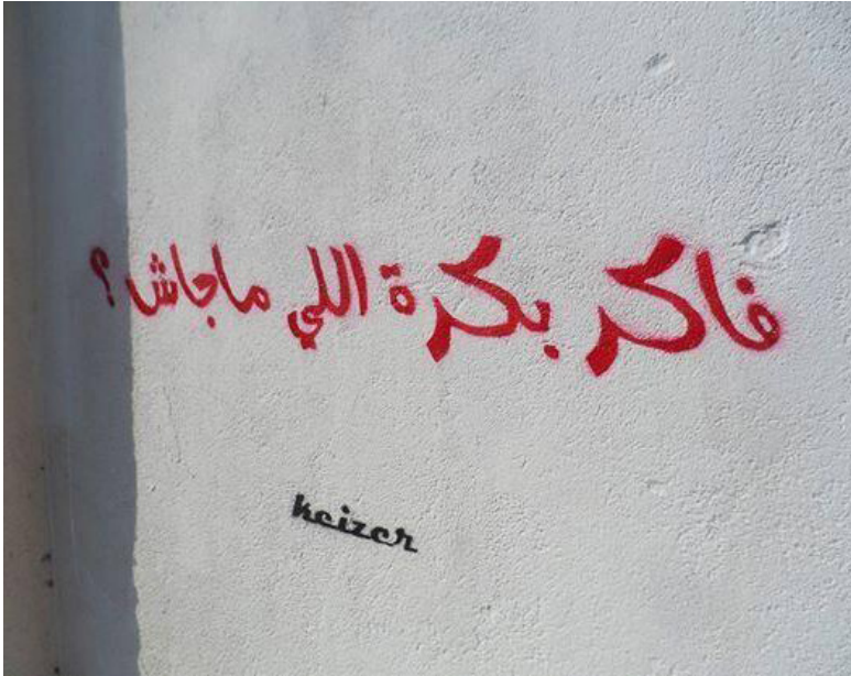
Fig. 14: Keizer, "Do you remember tomorrow that never came?" 2014. Unknown location.