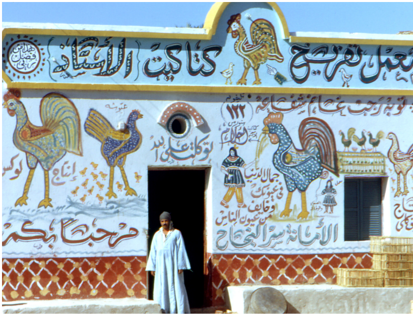
Fig. 1: Advertising a chicken farm in Fayoum, 1976. Fayoum.

The term “street art,” also referred to as “urban art” and “the art of the subaltern and of political protest,” is used in this essay more generically to encompass various forms of visual arts created in public spaces, graffiti and calligraffiti among them (Abdulaziz 2015; Arnoldi 2015; Zoghbi and Karl 2012). Before the events of January 2011 in Egypt, they were most often found in contained settings and used mainly for advertising purposes (figure 1), or, as the murals on the walls of houses in Luxor and Nubia show, to narrate the hajj , or pilgrimage to Mecca (Dawson 2003; Naguib 2011; Parker and Neal 2009).