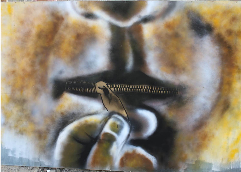
Fig. 5: Freedom Painters, 2011. Nasr City, Cairo.