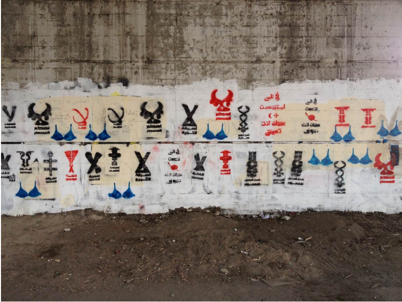
Fig. 7: Bahia Shehab, No, and a Thousand Times No, 2011. Cairo. Calligraffiti.