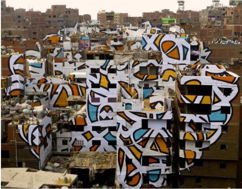
Fig. 18: el Seed, Perception, 2016. Cairo.

Another example of this kind of compromise is the anamorphic piece entitled Perception by the Tunisian-French calligrapher artist el Seed. He created it in Cairo's district of garbage collectors, Mansheyat Nasser (figure 18). The inhabitants are predominantly Copts who are known to have developed an efficient recycling system. El Seed spread his calligrapher on the surfaces of about 50 apartment buildings in the area. The piece, which can only be seen in full from a specific point on the Moqattam Hill, is a quote dating from the third century patriarch of Alexandria, St. Athanasius, "Anyone who wants to see the sunlight clearly must wipe his eyes first." 16