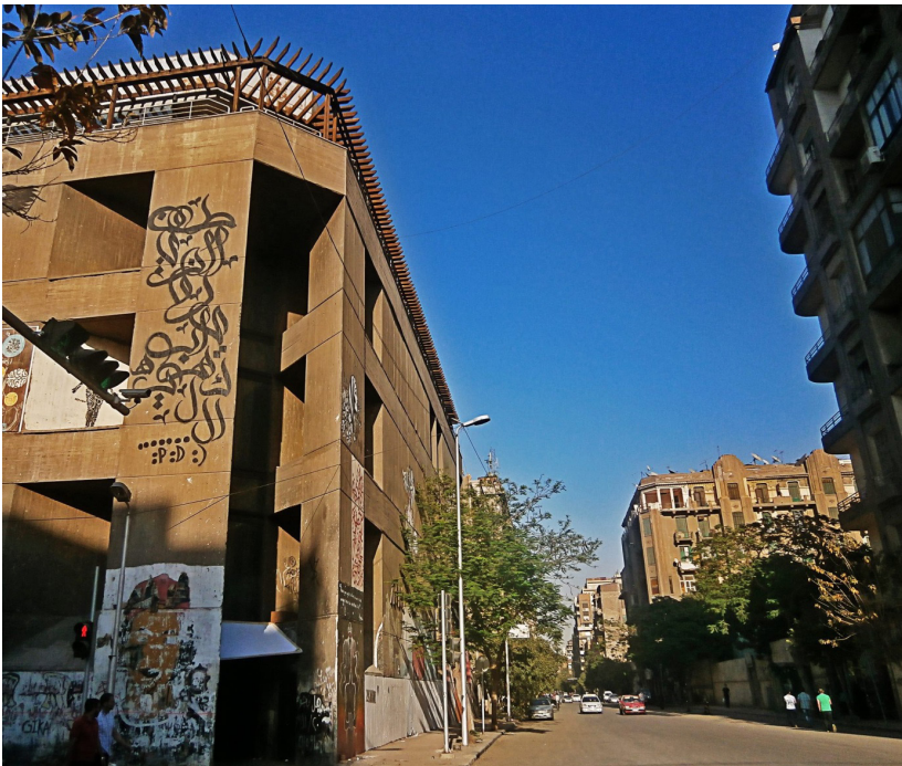
Fig. 16: Ahmed Naguib, “Switch off the light Bahya,” 2015. Cairo. Calligraphitti.

University in Cairo (figure 16). 14 The text, composed of interlaced superposed letters and words, reads “ Taffī al nūr yā Bahya... ” (Switch off the light Bahya...). Bahya is a girl’s name meaning “beautiful, radiant, splendid”; it is also used as an epithet for Egypt. The line is from a song from the 1998 musical, Al malik hūwa al malik ” (The king is the king), by the composer and singer Mohamed Mounir (Mounir 2011). The musical, in turn, is an adaptation of the play bearing the same title by Syrian playwright Saadallah Wannous (1941–1997). Penned in 1977, the play was performed in the late seventies but was subsequently banned from the stage in Syria. 15 The rest of the text in the musical, that is not included in the calligraphitti, says: “...switch off the light Bahya, all the military are thieves. But in our country not only the military are thieves.”