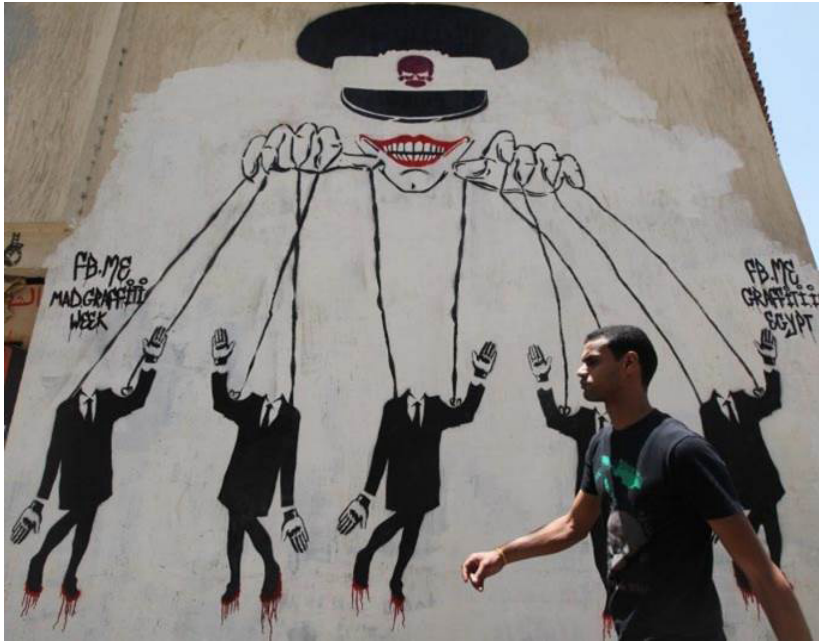
Fig. 3: Mad Graffiti Week (Facebook group), Joker as a puppeteer, 2012. Cairo.

However, the majority of Egyptian artists I interviewed considered themselves street artists, resorting to graffiti and calligraffiti as one of their many modes of expression and techniques. Accordingly, they consider street art, which is also referred to as “urban art,” the art of the subaltern, political protest, and one of their many modes of expression and techniques. Graffiti includes a great variety of genres and styles and mixes several graphic genres such as calligraphy, poster art, and graphic novels (Genin 2013, 22–32). The word “graffiti” combines the notion of writing derived from the Greek, graphein , to write, and that of incising, from the Italian sgraffiare , to scratch. The term is used in art history and archaeology to designate inscriptions and drawings that have been added to a cave, monument, statue, or painting. Graffiti has existed since the most ancient times and several sites and monuments dating from prehistory, pharaonic Egypt, Ancient Greece and the Roman Empire show the passage of time through the names, words, phrases, and drawings people have inscribed on them while visiting. Today, graffiti range from simple words, the artist’s signature or tag, or short phrases to elaborate wall paintings or pieces. The term “calligraffiti” was coined by the Dutch graffiti artist Niels Shoe Meulman and denotes the combination of traditional calligraphy, with its strict rules and methods, with the nonconformity and openness of graffiti and