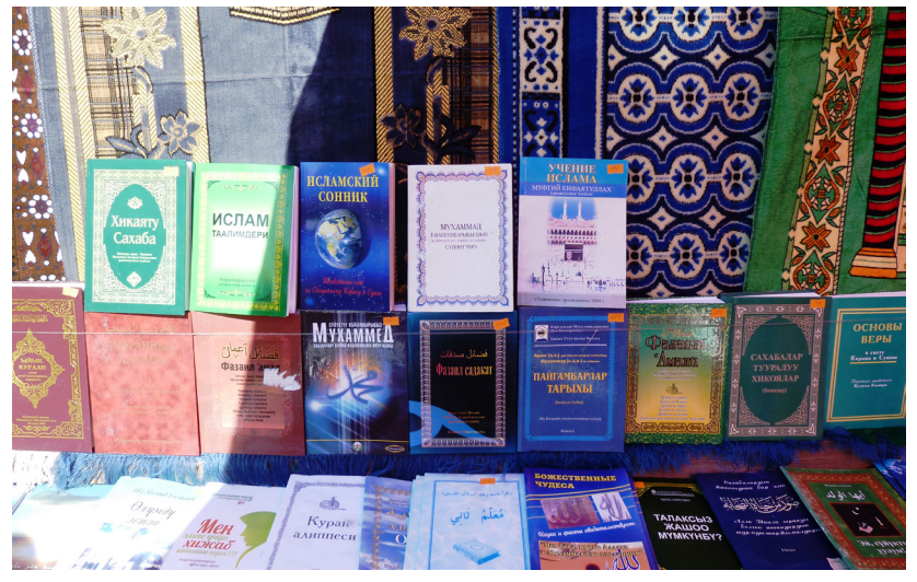
Fig. 2: Hadith collection of the Tablighi Jama'at, Fazail-e Amal, in Kyrghyz, in Islamic bookstall in Bishkek (2nd row, 3rd from right)