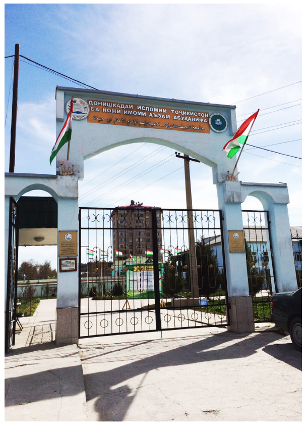
Fig. 4: Entrance to the Tajikistan Islamic Institute Abu Hanifa, Dushanbe.

and Master of Arts format. The authorities' concern was to provide religious education in a format that would get its graduates into reliable regular employment.<sup>50</sup> This emphasis was apparently meant to clearly distinguish the institute from religious schools belonging to the South Asian madrasa system. The political backdrop to this argument was the assumption that the perceived lack of employment opportunities for madrasa graduates provided incentives for them to join radical or militant movements. Following this line of thinking, structural and systemic changes mandated by the Tajik state ensured that the teachers as well as the Islamic institute itself—as much as the only Islamic high school—would form inalienable parts of the unified