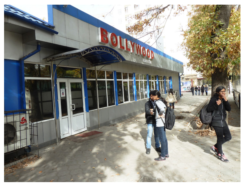
Fig. 5 Student restaurant "Bollywood" in Bishkek offering Indian food.

Here in Kyrgyzstan and Tajikistan, social and economic capital flowed in reverse to South Asia. The South Asian students from India and Pakistan lived together in one hostel, ignoring the constraints and polarities of the tense political relationship between their home countries. In Bishkek, they even had joint student representation. Their presence created a small South Asian world near the Bishkek medical institute hostel, with a separate student restaurant named "Bollywood" that served Indian food (fig. 5) and a local business established by one of the Pakistani students that produced and traded South Asian food and sweets. The ISM tried to make the town attractive for South Asian students by highlighting on its website that "Bishkek is also a centre for several Indian and Pakistani restaurants (like The Host, Indian Village, Pizza one, Mac Burger, Begemot etc.) giving several options for students to dine and hang out."<sup>76</sup> In the same vein, Dushanbe city hosted several Indian and South Asian eating places, adding to the feeling of home for South Asian students.