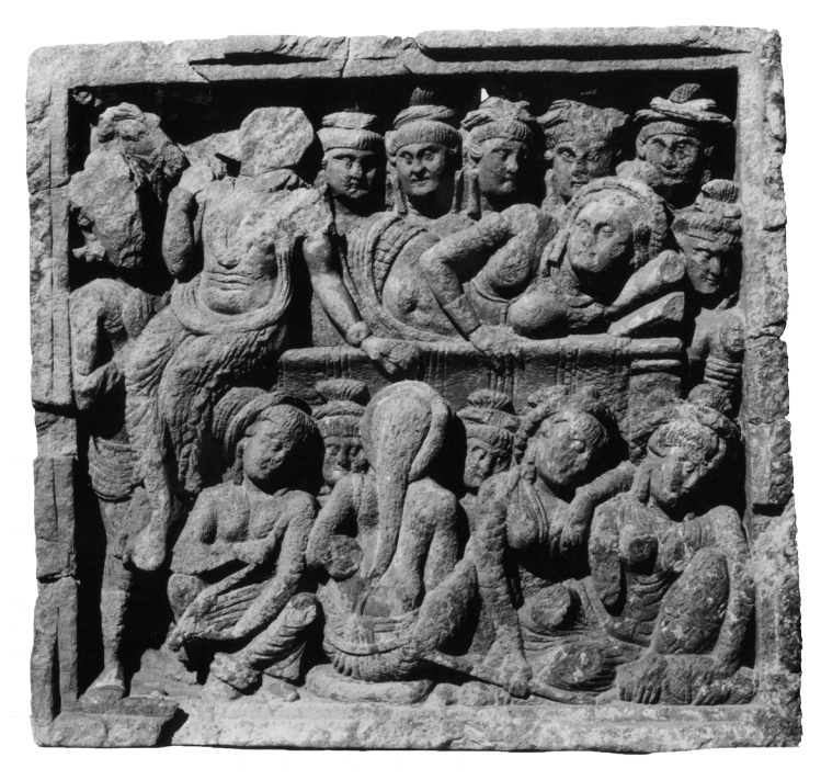
Fig. 11: Relief found at Butkara I, Swat Valley. Swat Museum, Saidu Sharif, Pakistan. [Fig. 4 in the original.]

overestimated, stylistic element of Parthian origin while overlooking what is actually significant in these reliefs, namely the knowledge of Indian stylistic elaborations, particularly those of Bharhut.<sup>33</sup>