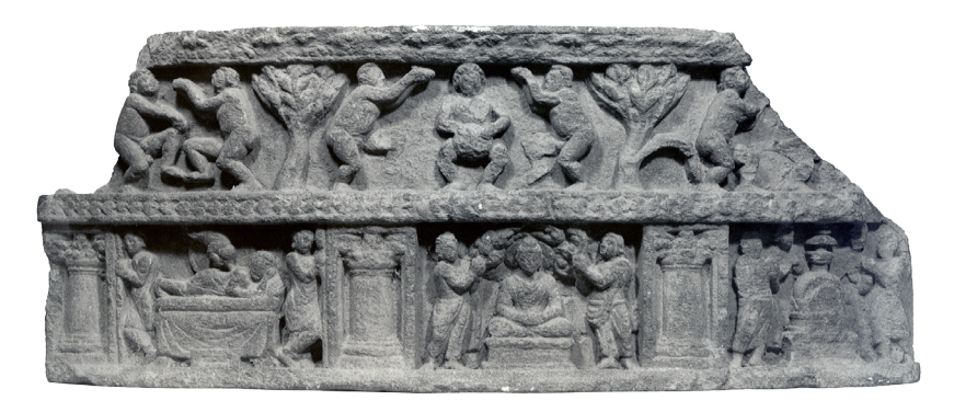
Fig. 8: Provenance unknown. Private collection. [Fig. 8 in the original.]