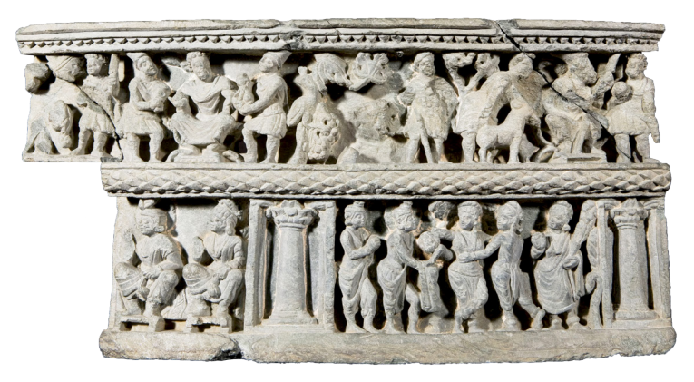
Fig. 9 : Relief found at Saidu Sharif I, Swat Valley. Museo Nazionale d'Arte Orientale, Rome. [Fig. 9 in the original.]