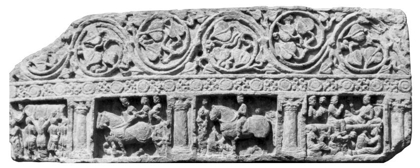
Fig. 7: Provenance unknown. Private collection. [Fig. 7 in the original.]