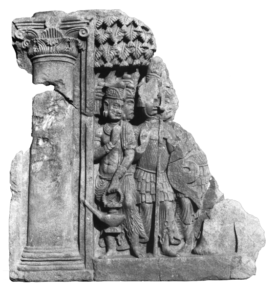
Fig. 6: Relief found at Saidu Sharif I, Swat Valley. Swat Museum, Saidu Sharif, Pakistan. [Fig. 6 in the original.]