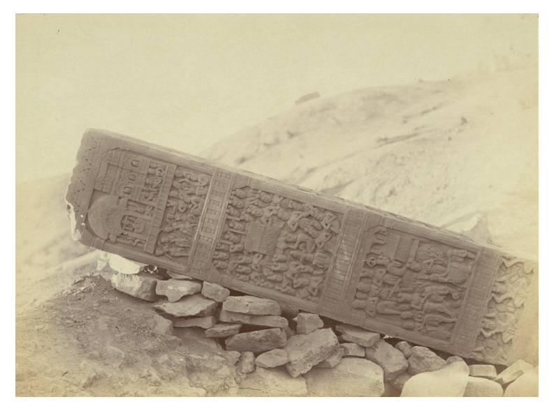
Fig. 4: Pillar from the Bharhut Stupa. Indian Museum, Calcutta. Repository caption: Sculpture piece excavated from the Stupa at Bharhut: left side of Ajatachatru pillar. Photographic print, 1874. Photographer: Joseph David Beglar. British Library, Photo 1003/(1493). [Fig. 1 in the original.]

Brewster (1926), Edward J. Thomas (1927), C. A. F. Rhys Davids (1928), Ernst Waldschmidt (1929), Alfred Foucher (1949), Giuseppe Tucci (1967), and André Bareau (1985), just to name the most well-known.