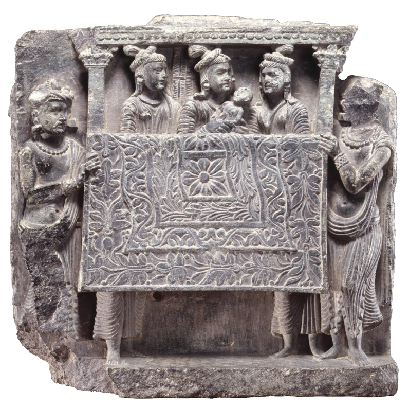
Fig. 12: From Swat (?). Museum caption: Gandhara School, The Return to Kapilavastu, 1<sup>st</sup>-2<sup>nd</sup> century. Found at Swat Valley. London, British Museum, 1972,0920.1. [Fig. 5 in the original.]

succession pattern characteristic of Gandhāra, even if there is nothing to ensure that this succession was rigorously chronological: but tendentially it certainly was.