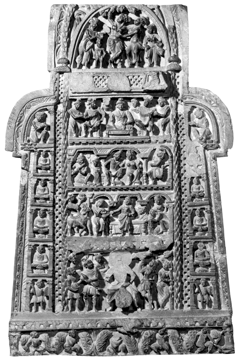
Fig. 15: Provenance unknown. Museum caption: Scenes from the Life of Buddha, 1<sup>st</sup> century–320, Kushan Period. Schist, 68.0 x 41.30 cm. Found at Gandhara, Pakistan. Now preserved at Cleveland Museum, 1958.474. [Fig. 13 in the original.]