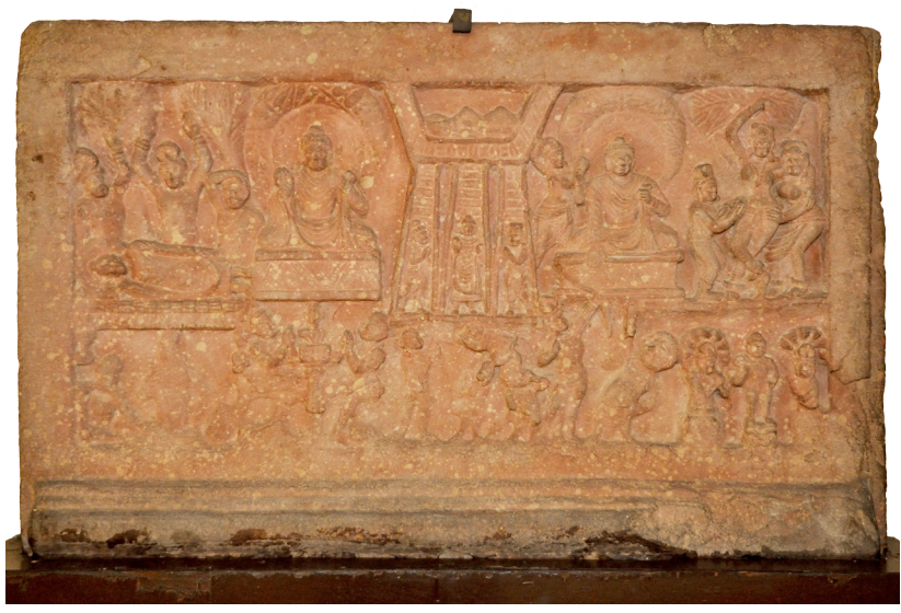
Fig. 14 : Relief from Mathura. Museum caption: Life Scenes of Buddha, ca. 2<sup>nd</sup> century. Mathura Museum, Mathura, India. [Fig. 14 in the original.]

cannot go beyond the impression on the senses, to busy herself with feeble and subordinate images, beyond which is that visible fullness of expression which she shuns as her boundary."<sup>47</sup>