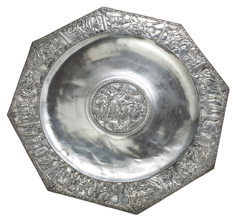
Fig. 13: Silver plate from Kaiseraugst. Museum caption: Achilles plate, 330–340. Silver, 4643 grams. Produced at Pausilypos, Thessalonica-Thessaloniki, found at Kaiseraugst, Switzerland. Augst, Museum Augusta Raurica, 63. [Fig. 15 in the original.]

On the other hand, Buddhism was certainly not the only Asian religion with which Hellenism had to do, and we may speculate whether, rather than merely "forms" of the Hellenistic tradition being bent to the expressive demands of Buddhist art, we should not also talk about a narrative structure that had been developed in Northwestern Buddhism, for which Hellenism was able to readily provide the most suitable formal repertory, and which it, in turn, appropriated to have it reflect afterwards on other, more Western, religious experiences.