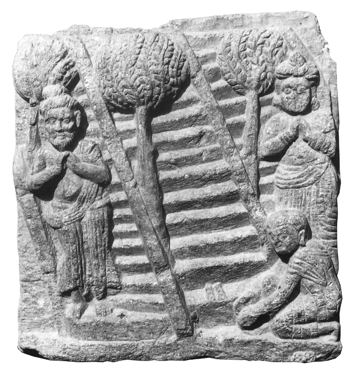
Fig. 1 : Descent of Buddha from the Trāyastrimśa Heaven. Relief found at Butkara I, Swat Valley, Pakistan. Now preserved Swat Museum, Saidu Sharif. [Fig. 3 in the original.]

It is not always possible to draw a definite line between myth and story; on the other hand, it is not even always possible to clearly separate mythical and logical thinking. But this is an issue that would take us too far from our topic.