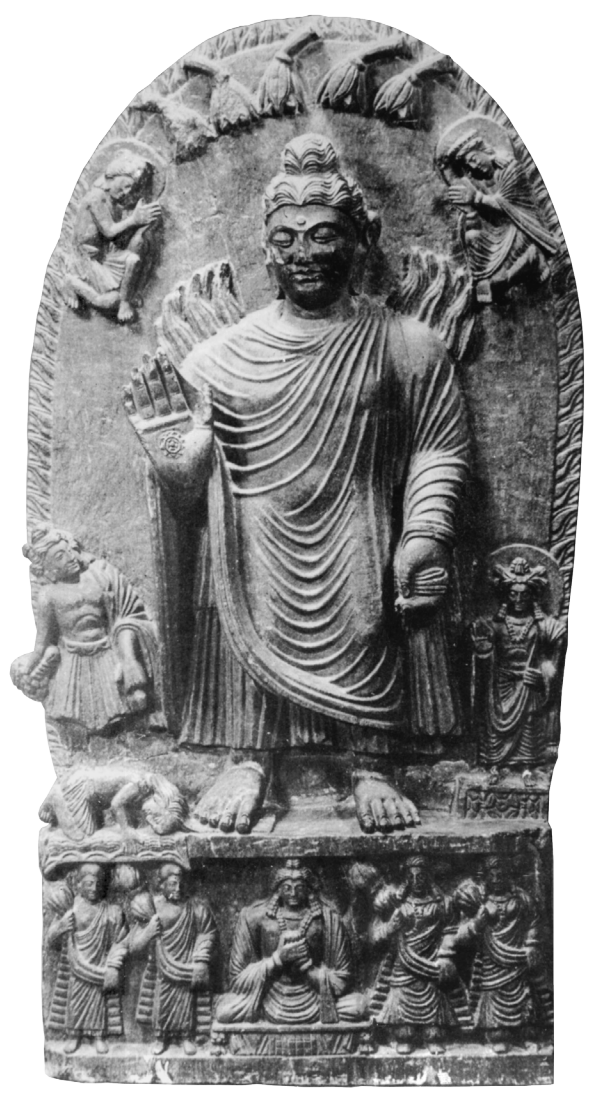
Fig. 2: Stela from Kāpiśa, Afghanistan. Now preserved at National Museum of Afghanistan, Kabul. [Fig. 12 in the original.]

I think that, at this point, the fundamental difference between icon and narrative representation should be clear; but it should be equally clear that it would be a mistake to consider these two categories as being quite distinct, without overlapping.