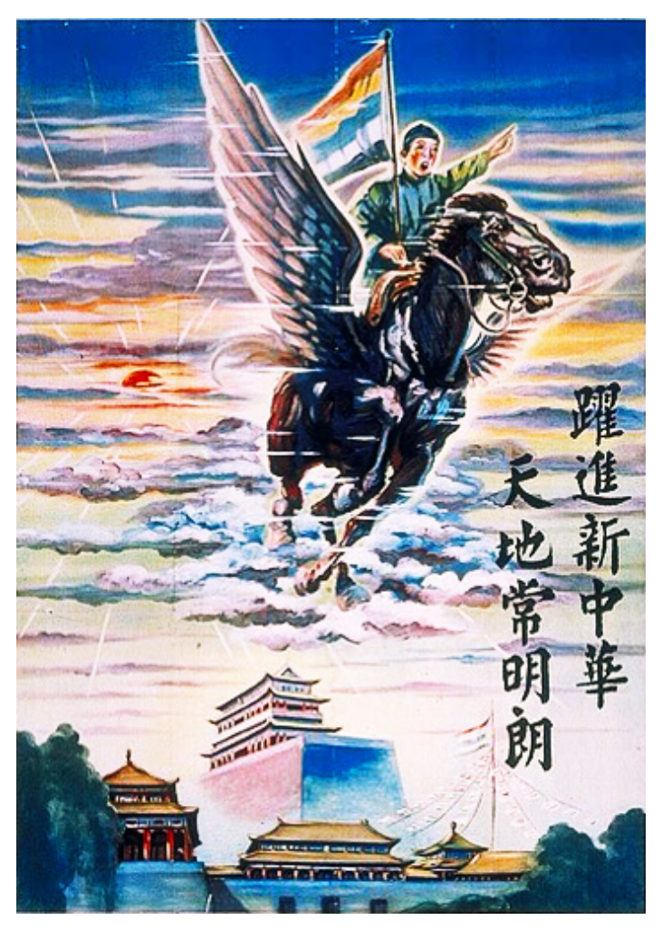
Fig. 1: Poster "As we gallop towards a new China, heaven and earth are always bright," text in Chinese, ca. 1937-40, China. Lithograph, 40 x 30 in. Stanford, Hoover Institution Library and Archives.

sunrise with multi-colored clouds scattering the light. The rising sun takes up the symbol of the sun from the Japanese flag and the "New China" that is bathing in its light is made up of a a group of Chinese buildings, including pavilions, city gates and gate towers that are to evoke the Chinese tradition and its values. Some buildings are fading into the clouds while others are partially concealed by trees, a quintessential scene of imperial Beijing.