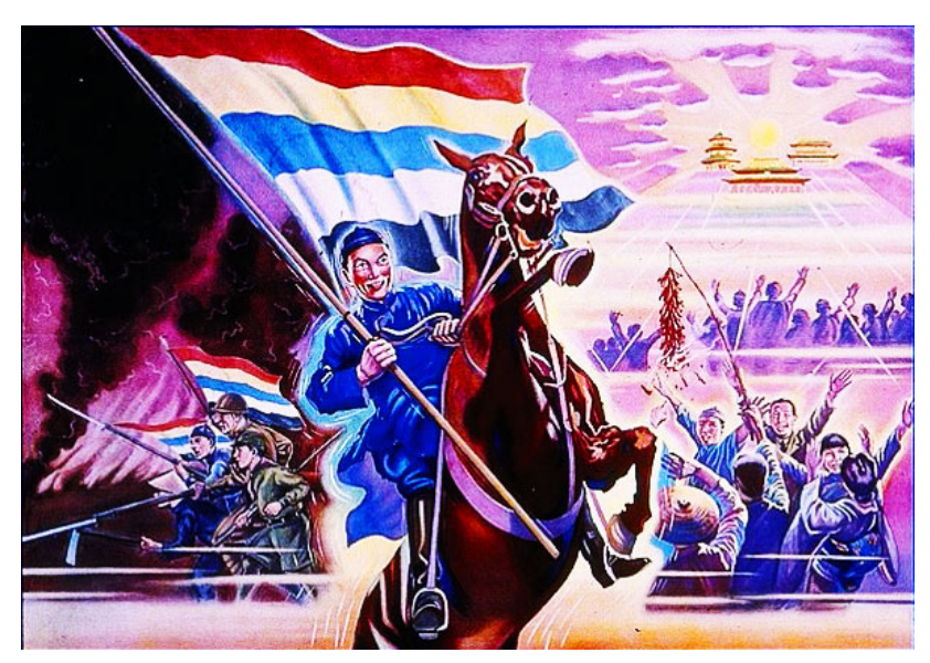
Fig. 6: Poster "Celebrate the New Order," ca. 1939-40, China. Lithograph, 31 x 41 in. Stanford, Hoover Institution Library and Archives.

the poster is a woman in Japanese costume, serving to highlight the Pan-Asian posture of the ruling government. Relating Chiang Kai-shek, who was in a United Front with the Communists, to Stalin, the GMD-CCP Alliance appears as a dark and gruesome future that has to be prevented by all means. Under the assumption that many Chinese were unfamiliar with the principles and ideals of Communism, relating Chiang Kai-shek to such a foreign ideology was a plausible strategy to discredit him.