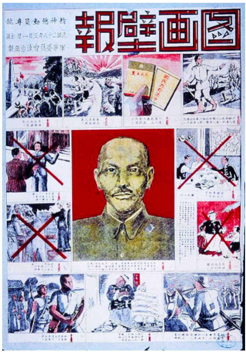
Fig. 10: Poster Tuhua bibao (Pictorial Wall Post), text in Chinese, 1940, China. Published by the Political Department of the Military Command. Lithograph, 31 x 21 in. Stanford, Hoover Institution Library and Archives. In the caption the president says: "Anything that is advantageous to the enemy and harmful to the nation should not be done. Anything that is advantageous to the nation and helpful for our military affairs should be done with great efforts."