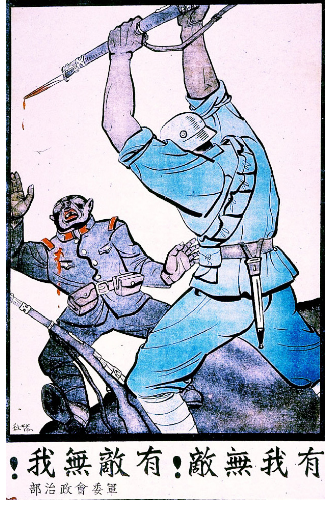
Fig. 7: Poster "It is the Enemy or Us!" Text in Chinese, ca. 1938-45, China. Published by the Political Department of the Military Command. Lithograph, 22 x 17 in. Stanford, Hoover Institution Library and Archives.

The message in this poster is quite straightforward: the Chinese can beat the Japanese. It also aims to arouse hatred towards the foreign enemy. There are no cultural symbols to give the audience any clues as to the difference between the two countries, but the Japanese soldier is shown with sideburns, darker skin and an angular physiognomy, underscoring the fact that he is ethnically alien to the Chinese. Needless to say, hatred of foreign enemies