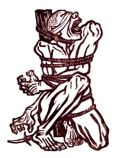
Fig. 12: Li Hua 李華, China, Roar, woodcut, 20 x 15 cm, 1936.