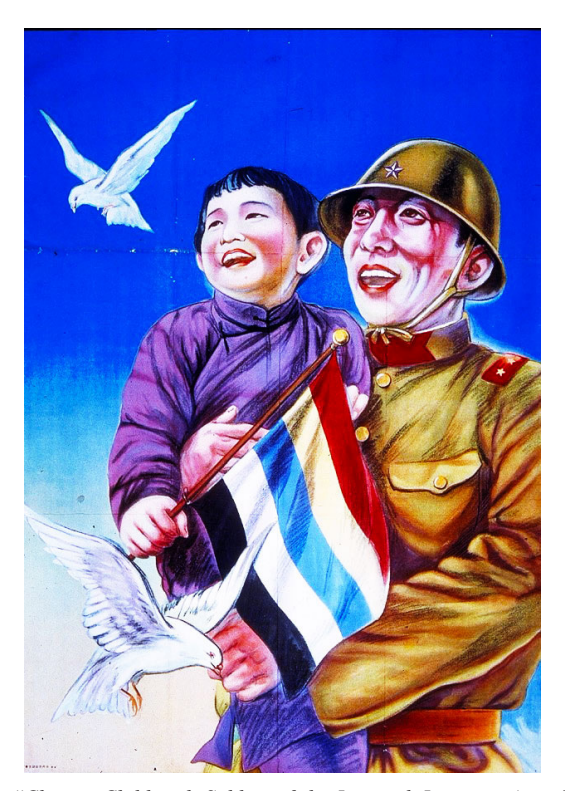
Fig. 3 : Poster "Chinese Child with Soldier of the Imperial Japanese Army," ca. 1939-40, China. Lithograph, 40 x 30 in. Stanford, Hoover Institution Library and Archives.

In addition to "orthodox East Asian culture," the IJA tended to underscore the ideas of "peace" and "protection" (figure 3). This poster, for example, features several related symbols such as peace doves, smiling faces and a young child. The pastel colors compose an idealized world in which hatred and fear are absent. At the center of the poster, a Japanese Imperial Army soldier holds a child who is grasping a five-colored flag, and both are smiling and looking into the distance of an ideal future. A peace dove flies in a blue sky above while another takes food from the soldier's hand. The soldier, a perfect example of romantic heroism, plays here a maternal rather than a martial role, hiding the uglier aspects of the world from the eyes of the child. The poster invokes people's desire for peace and harmony rather than radical change and the cruelty of the battlefield.