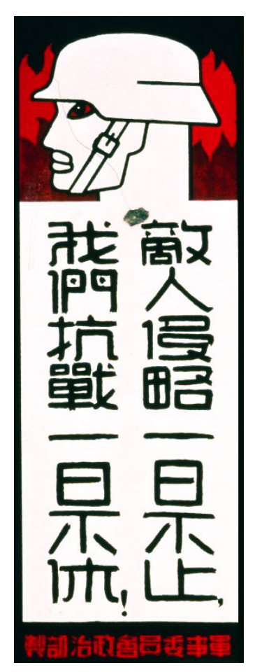
Fig. 9: Poster "Every day the enemy does not stop its aggression is a day in which our resistance will not rest," text in Chinese, ca. 1939-42, China. Published by the Political Department of the Military Command. Lithograph, 31 x 11 in. Stanford, Hoover Institution Library and Archives.

promotes the ideal of a "disciplinary and obedient citizen" for the nation with clear instructions given in a "right way versus wrong way" language (figure 10). This poster, produced by the Political Department of the Military Command, is utterly didactic in its pictorial and verbal depiction of models of nationalist discipline. Created in the wake of the Japanese invasion to explain the stakes of war more precisely, this revolutionary imagery was directed equally at Nationalists and Communists to inspire resistance to the invaders. At the center of the poster is a portrait of Chiang Kai-shek, with four boxes