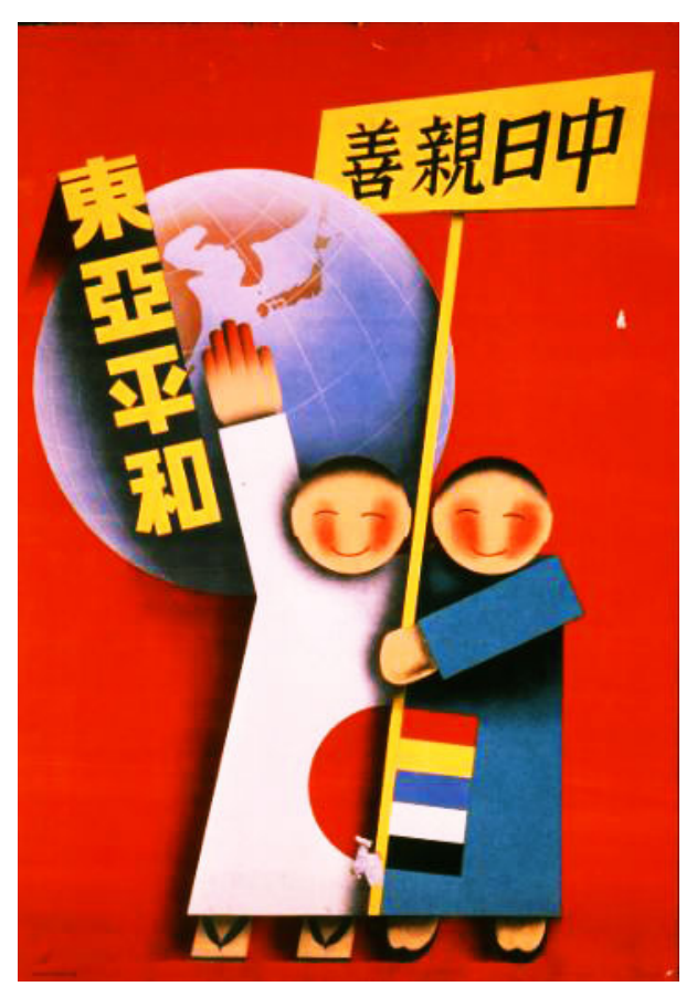
Fig. 4: Poster "Good Will Between China and Japan," text in Chinese, ca. 1938-39, Japan. Lithograph, 31 x 21 in. Stanford, Hoover Institution Library and Archives.

The ideas of "peace" and "protection" were sometimes translated into the notion of "brotherhood" (figure 4). This poster, titled "Good Will Between China and Japan," features two cartoon-like characters: a Chinese man, dressed in blue and holding the banner with this slogan, and a Japanese man, dressed in white and waving his arm, along which a slogan reads "Peaceful Order in East Asia." Both have large, smiling faces with red cheeks. In the background is a map of the globe that focuses on Japanese territory, clearly indicating Japan as being the leader of this community of brotherhood. As in the previous poster, red, the most auspicious color, predominates. In most political posters produced by the Japanese Imperial Army, Japan is visualized as the elder brother (figure 5). The poster, entitled "China and Japan Are Like Brothers that Build East