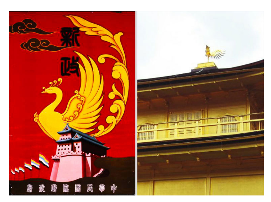
Fig. 2: Poster The New Political Order, text in Chinese, ca. 1938-39, China. Lithograph, 30 x 21 in. Stanford, Hoover Institution Archives (left). Bronze Phoenix on the roof of the Golden Pavilion at Kinkaku-ji. (right).

ancient Asian mythologies. In China, as well as in Japan, the mythical Phoenix was adopted as a symbol of the imperial household, particularly the empress. This mythical bird represents fire, the sun, justice, obedience, fidelity, and the southern star constellation.<sup>31</sup> According to legend, the Hō-ō (phoenix in Japanese) appears very rarely, and only to mark the beginning of a new era—the birth of a virtuous ruler, for example. In another tradition, the Hō-ō appears only in peaceful and prosperous times (nesting, it is said, in a paulownia tree), while hiding in times of trouble. As the herald of a new age, the Hō-ō descends from heaven to earth to do good deeds, and then returns to its celestial abode to await a new era. It is a symbol both of peace (when the bird appears) and of disharmony (when it disappears)."<sup>32</sup> Therefore, the phoenix on the top of the gate tower most likely symbolizes the peace after rebirth, accomplished through the occupation of the Japanese Imperial Army. At the same time,