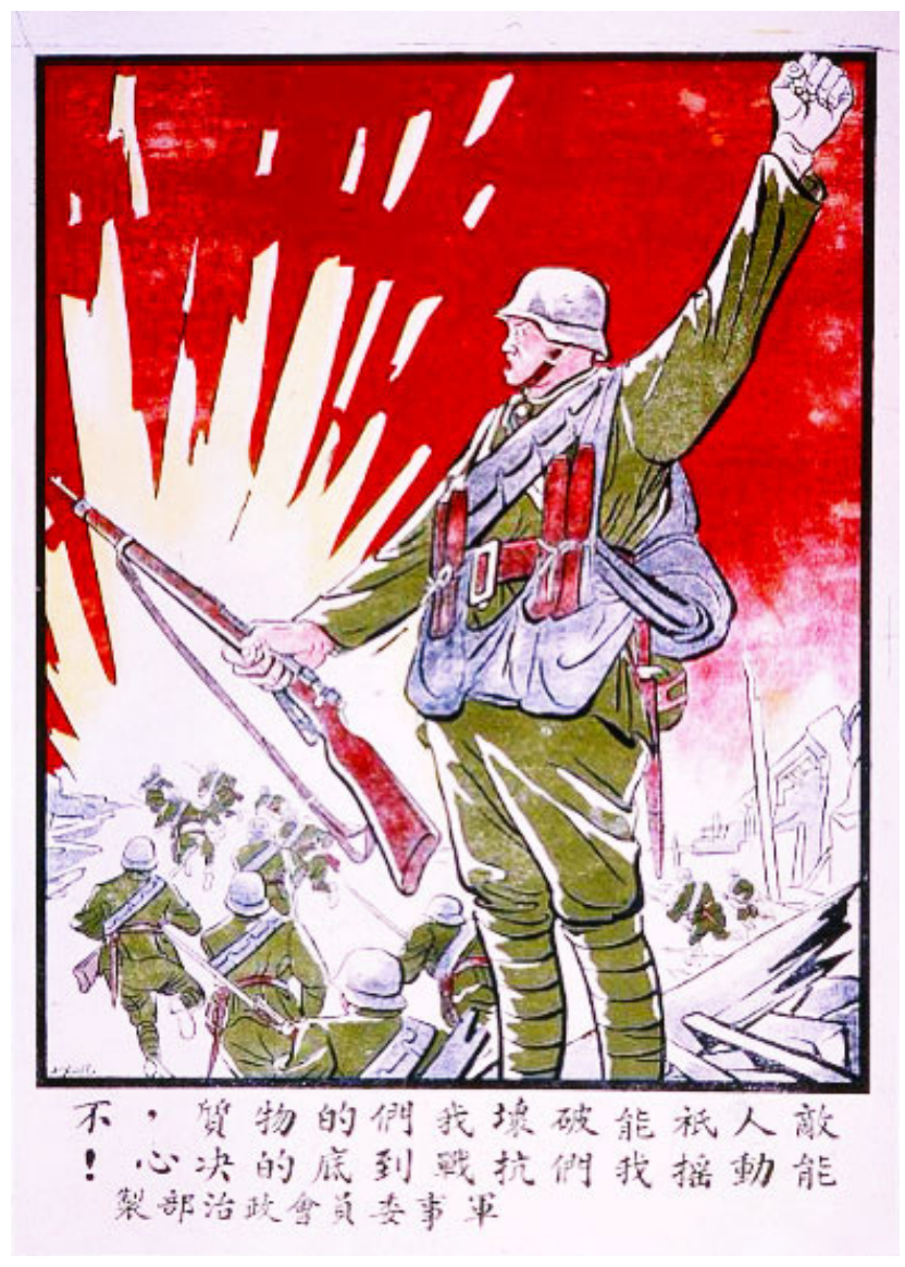
Fig. 8: Poster "Enemies can destroy our materials but they cannot shake our will," text in Chinese, ca. 1939-45, China. Published by the Political Department of the Military Command. Lithograph, 21 x 15 in. Stanford, Hoover Institution Library and Archives.