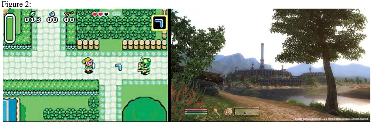
On the left a screenshot from Zelda: A Link to the Past (Nintendo 1992) and on the right, a screenshot from Elder Scrolls Oblivion (Bethesda Softworks 2006)

In conveying narratives, video games operate in the same way as traditional media, such as literature and film, by causing the participant (or viewer in the case of massive media) to empathize with the characters of the story (emotional attachment). This attachment is enhanced in game play due in part to the in time investment players make in completing in game narratives. Unlike films which are rarely longer than three hours, some narrative video games, such as those in the Final Fantasy series, can take over one hundred hours to complete. With this extended relationship to game characters comes greater emotional bonding. In one game, entitled Sims 2,<sup>27</sup> the player literally follows a single character from the cradle to the grave. Once a character has passed away the player can, if he or she chooses to, continue playing as the deceased character's children and eventually grandchildren. Video games have the ability to directly put the player into an virtual character's shoes, so that the player literally sees out from the character's eyes. This level of immersion enhances narrative experience by forcing the players to consider what they would do were they actually a the protagonist of a given story. "When you play a video game you enter into the world of the programmers who made it. You have to do more than identify with the character on screen. You must act for it."28