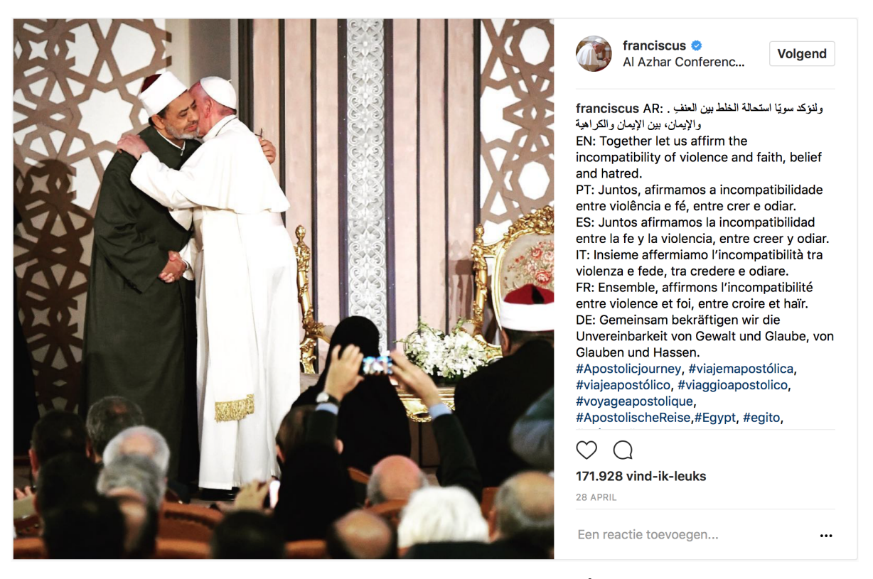
Photo 1: Screenshot from Instagram: Pope Francis at Al Azhar<sup>2</sup>.