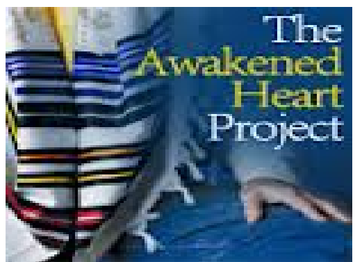
Figure 3: Logo of the awakened heart Project

In another style, the visual of the AHP shows the photograph of a man sitting in the 'lotus seated pose', the classic Buddhist meditation posture, but wearing a tallit, the Jewish prayer shawl (Figure 3) <<u>http://www.awakenedheartproject.org/</u>>.