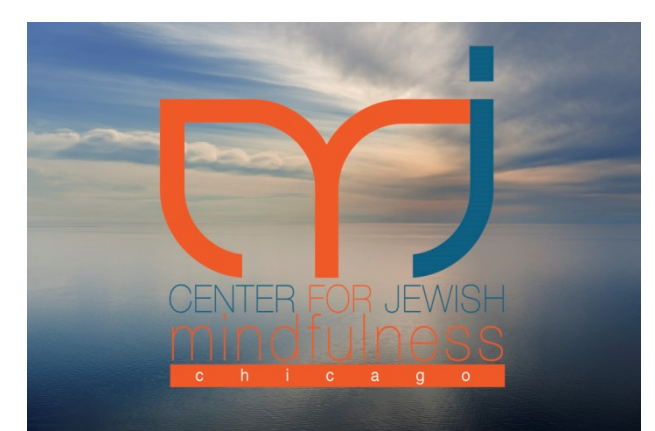
Figure 2: Logo of the center for Jewish mindfulness of Chicago.

In another style, the visual of the AHP shows the photograph of a man sitting in the 'lotus seated pose', the classic Buddhist meditation posture, but wearing a tallit, the Jewish prayer shawl (Figure 3) <<u>http://www.awakenedheartproject.org/</u>>.