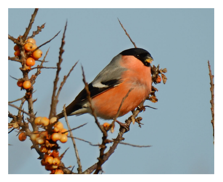
n. Bullfinch (Pyrrhula pyrrhula).