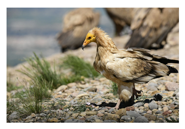
c. Egyptian vulture (Neophron percnopterus).