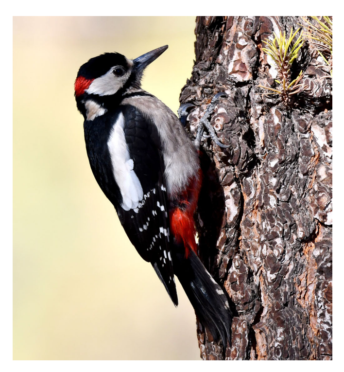
d. Great Spotted Woodpecker (Dendrocopos major).