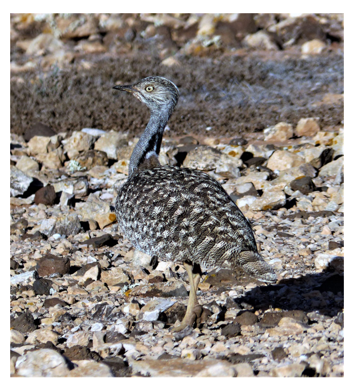
b. Houbara Bustard (Chlamydotis undulata fuerteventurae).