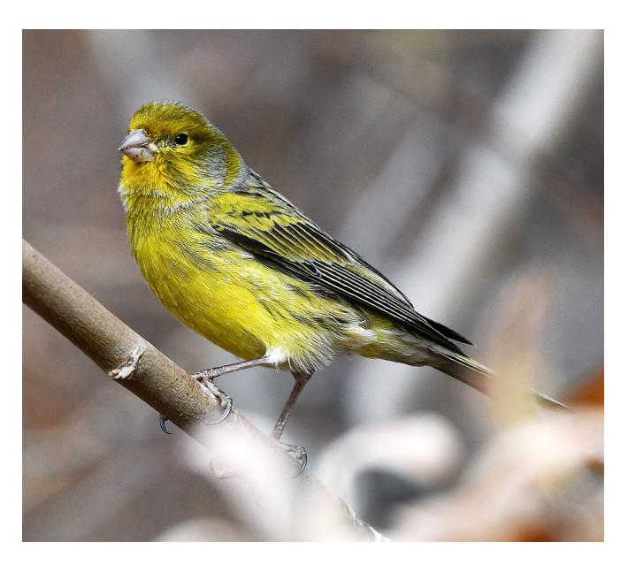
m. Canary (Serinus canaria; Photo: M. Vences).