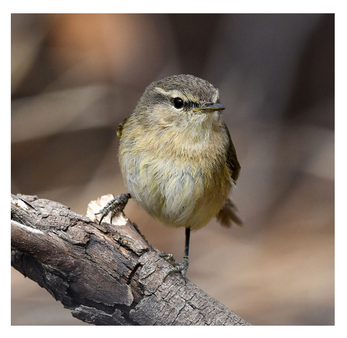
g. Canarian Chiffchaff (Phylloscopus canariensis).