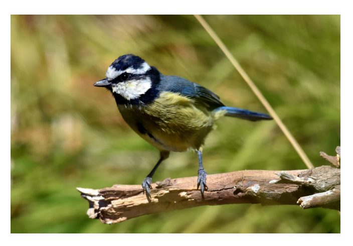
h. Canarian Blue Tit (Cyanistes teneriffae).