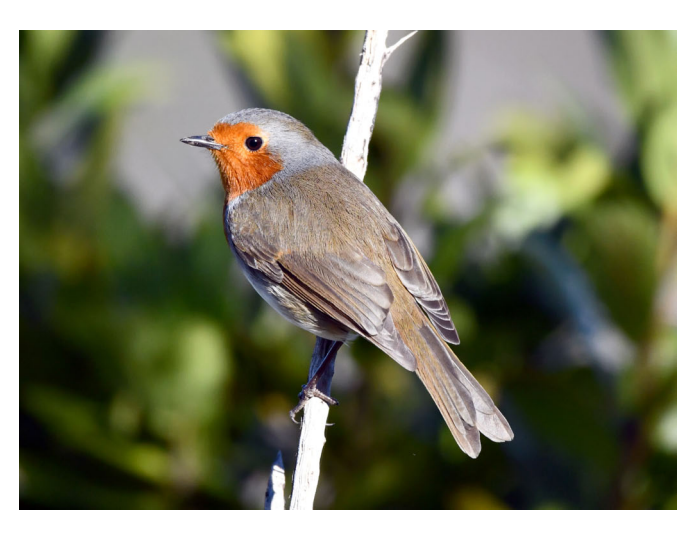
f. Canarian Robin (Erythacus r. superbus;).