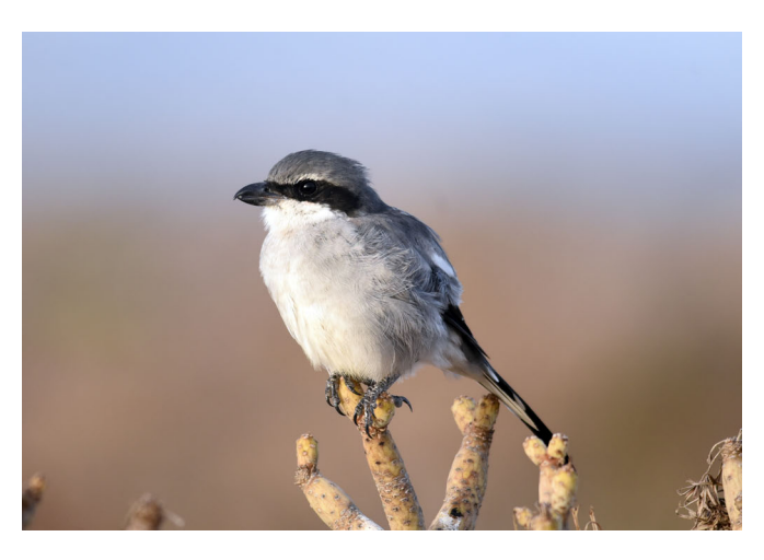
i. Grey Shrike (Lanius meridonialis koenigi).