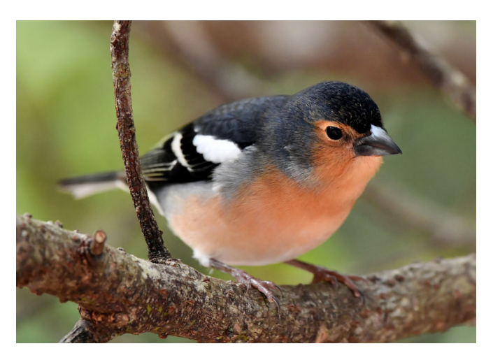
k. Chaffinch from Tenerife (Fringilla coelebs canariensis;).