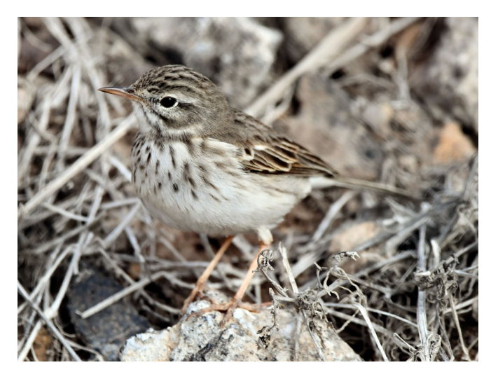
e. Berthelot's Pipit (Anthus berthelotii; Photo: M. Vences).