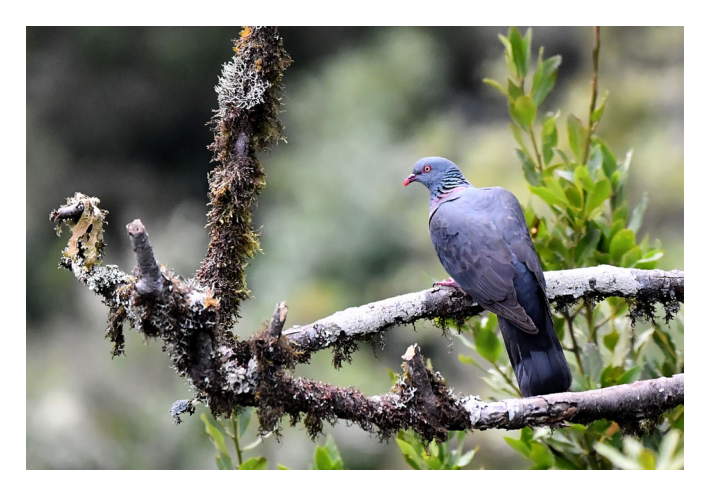
a. Bolle's Pigeon (Columba bollii).

Swift and Pallid swift ( A. pallidus ) cannot be clearly separated by mtDNA markers (Päckert et al. 2012), so that the differentiation of the subspecies A. pallidus brehmorum , which should represent A. pallidus on Macaronesia, also seems rather questionable. Stone-curlews ( Burhinus oedicnemus ) form distinct genetic lineages on the Canary Islands (Mori et al., 2017). The genetic status of the remaining endemic non-passerine birds and subspecies of Macaronesia ( Alectoris, Coturnix, Fregata, Ardea, Cursorius, Charadrius, Columba livia, Halcyon ; Table 2) has not yet been studied or noticeable differences were not discovered.