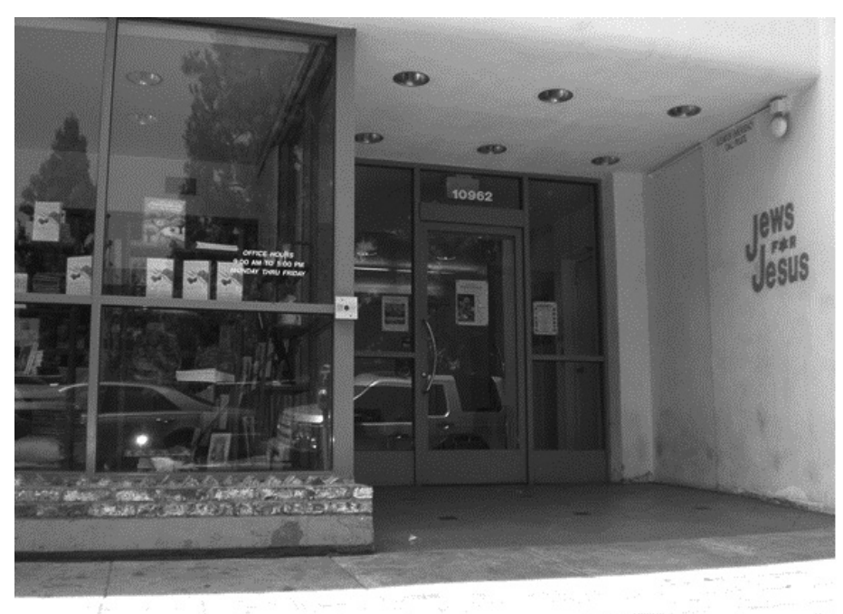
Figure 1: Los Angeles Jews for Jesus Store Front.