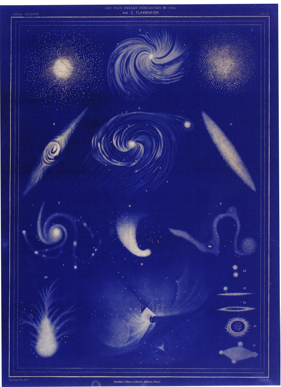
the End of the World