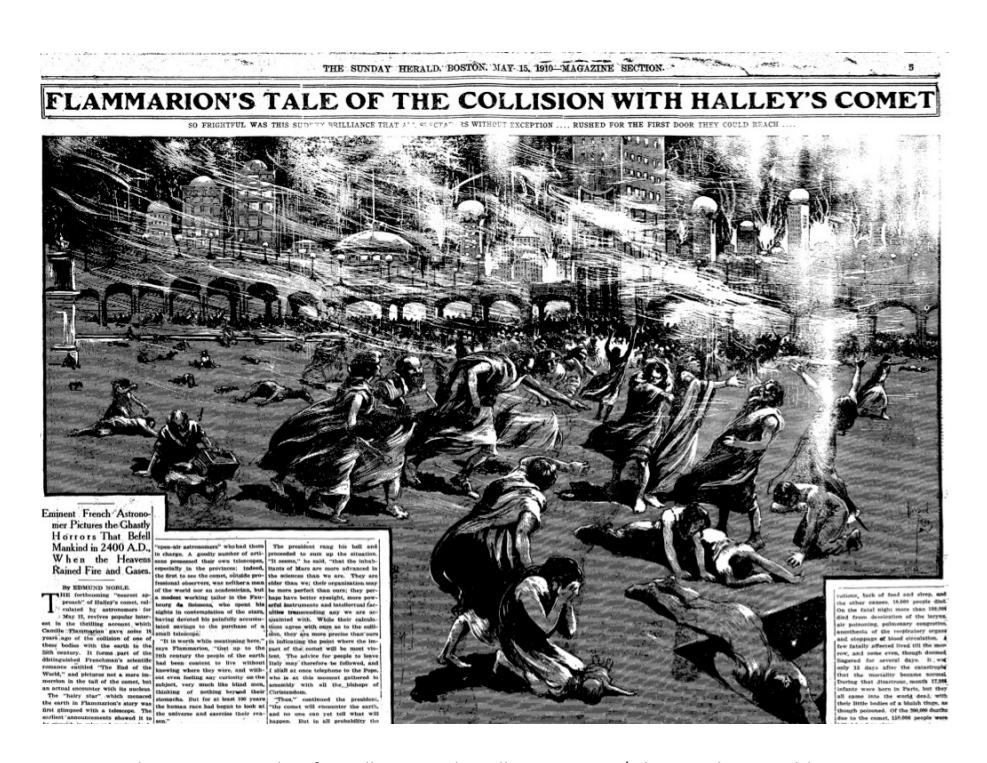
Figure 1. Flammarion's tale of a collision with Halley's comet. ( The Sunday Herald , Boston, Mass. 15 May 1910)

Urry: The Astronomer at the End of the World