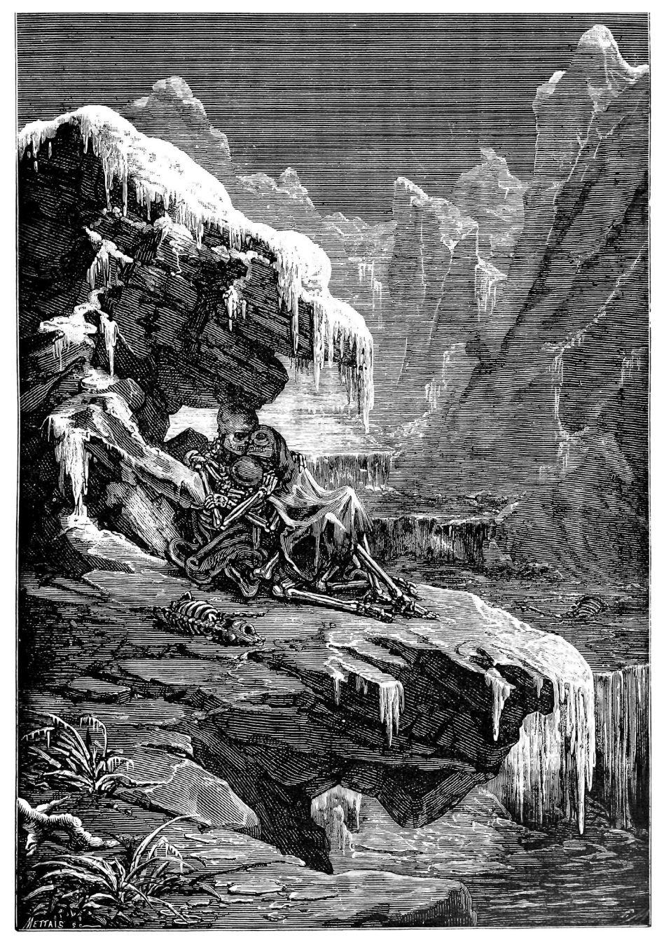
Apocalyptica No 1 / 2022 Urry: The Astronomer at the End of the World