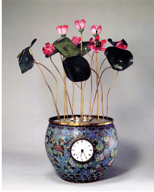
Figure 5: This eighteenth-century automaton with clock was produced by the Imperial Workshops and resembles some of the Beijing-produced automata-clocks described by Sigismondo in his correspondence.

in this world,” a reference to the gardens of the Imperial Summer Park, where he would divert himself after inspecting the progress made with the artwork. 42