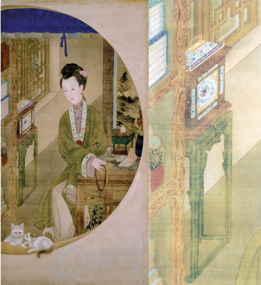
Figure 3: Sigismondo entered the inner apartments of imperial consorts to set up automata and clocks; in this depiction of an idealized consort in the inner chambers, probably dating to the Yongzheng period, notice the clock near the window.

In other words, offering their skills to provide goods for the capricious world of courtly leisure was a necessary middle ground for missionaries, where their religious rules and moral judgment had to be suspended to avoid major “disadvantages” for their mission. Ordinarily, for example, priests were not allowed to attend profane opera and comedies. However, when the emperor invited them, they could not refuse. In 1738, for example, the Jesuit painter Castiglione was recovering from illness and the emperor was so delighted that his beloved painter was feeling better, that he received him in audience and then invited him to an opera performed at court. The Propagandist Pedrini wryly mocked this invitation in front of other Jesuits at the Southern Church, saying “I am delighted that