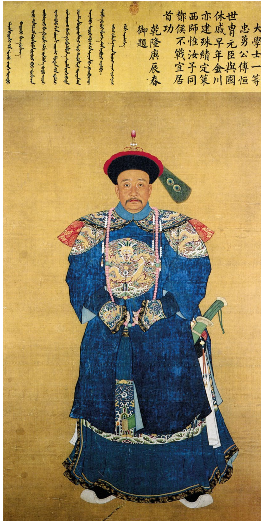
Figure 8: Portrait of Fuheng (大學士一等忠勇公傅恆) produced by order of Qianlong for display in the Ziguang Ge (Hall of Purple Light) at Zhongnanhai 中南海紫光閣, 1760, jointly painted by Jin Tingbiao 金廷標, Ignaz Sichelbarth SJ (Ai Qimeng 艾啟蒙), and painters from the workshop for the manufacture of enamel.