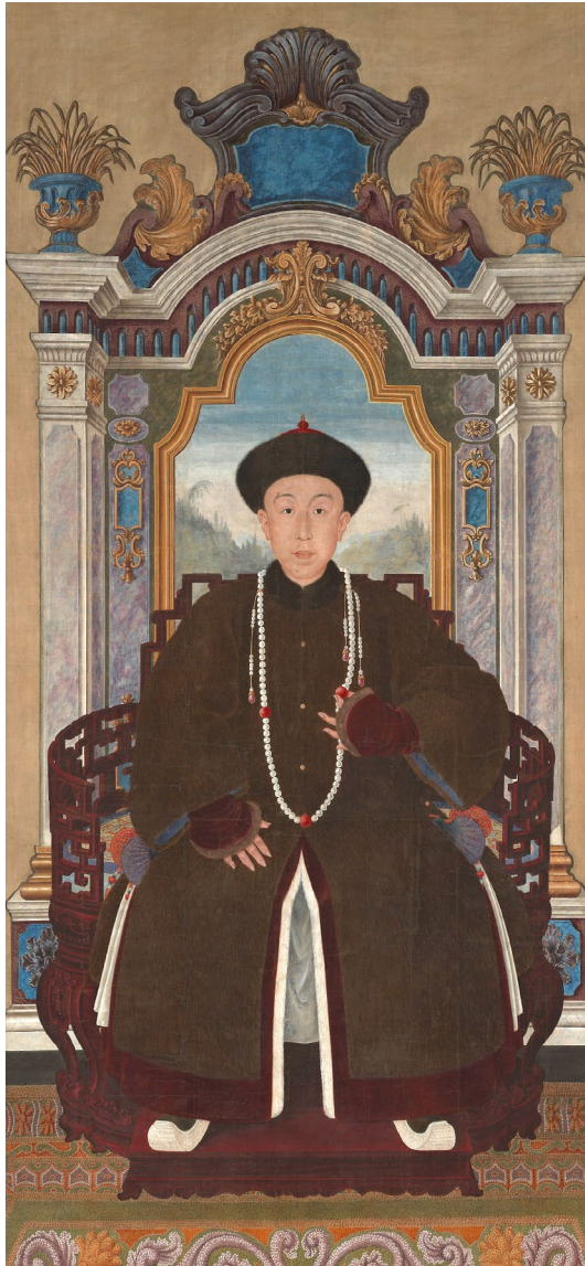
Figure 7: Portrait of Prince Hongyan 弘瞻 (1733–1765) with European architectural background, 1750s.