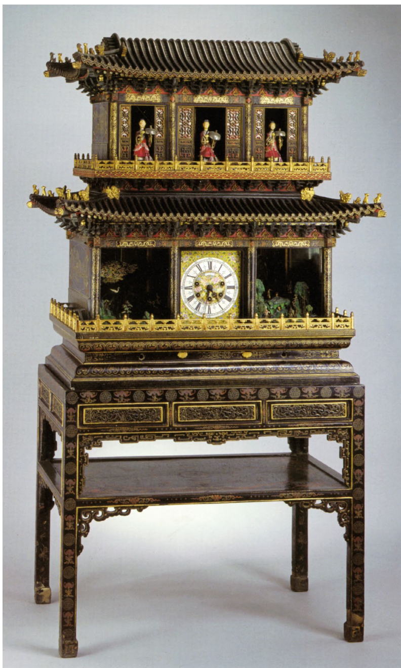
Figure 4: This clock was produced by the Palace Workshops between 1743 and 1749, at the time of Sigismondo Meinardi's employment at court.