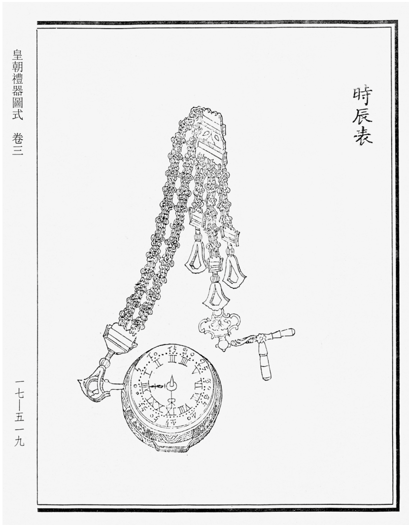
Figure 2: The second type of timepiece mentioned by Zhao Yi is called 時辰表 shízhēnbiao (hourly watch). Several of these pocket watches dating from the Qianlong reign are still preserved at the Palace Museum.